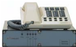
Remote Satellite Terminal RST100