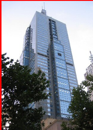
In building Emergency