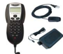
In-vehicle Telephone RST620