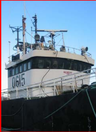
Ship Security Systems