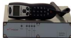
Remote Satellite Modem RST200