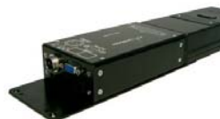
Voice / Data Module RST610