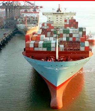
Remote Power Options