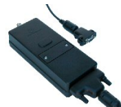
Data Module RST600 Using DC-DC Converter