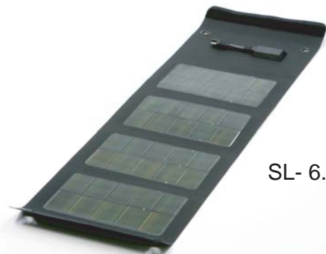
SL- 6.5 Watt